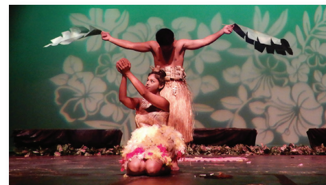
Performers act out a traditional Samoan folktale in "Fāgogo o Samoa," a cultural performance produced by Samoan Solutions that was underwritten by an SBCF grant and performed at Skyline College.