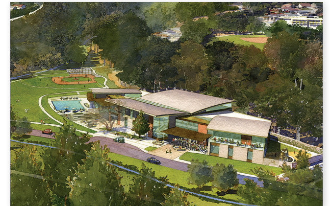
This conceptual design drawing provides a general sense of what the new recreation and aquatics center might look like in San Bruno City Park. Specific plans detailing exterior and interior features, design, and layout will be developed in the next stage of the planning process. The new center will be roughly situated in the current location of the Veterans Memorial Recreation Center.

Over the first half of 2018, the City, with the assistance of Group 4 Architecture, Research + Planning, Inc., hosted a variety of opportunities, including open houses, community meetings, popup booths, and an online survey, for San Bruno community members to give input on the vision for the recreation and aquatics center. With input from nearly 2,000 community members, Group 4 presented the City Council with a conceptual design proposal for the center's program, site plan, and design strategies in June. The City Council approved the conceptual design, and the City is moving forward with the next stage of the planning process – schematic design and development of the construction documents – to be backed by additional Foundation funding.