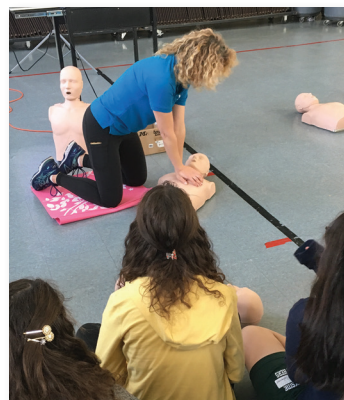
Students at Parkside Intermediate School attend a CPR training conducted by Via Heart Project and funded by an SBCF grant.