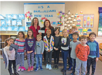
For the past three years, the Community Grants Fund has supported PARCA's REACH program at John Muir Elementary School.