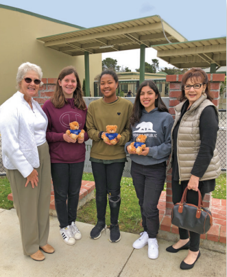
Parkside Intermediate School students attended the Tech Trek camp at Stanford University thanks to a grant to the AAUW North Peninsula Chapter.

In December 2018, the Board of Directors of the San Bruno Community Foundation approved 25 Community Grants totaling $300,000 to local organizations for programs that benefit the San Bruno community. The grant awards included: